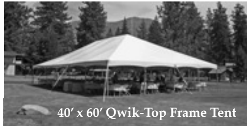
40' x 60' Qwik-Top Frame Tent