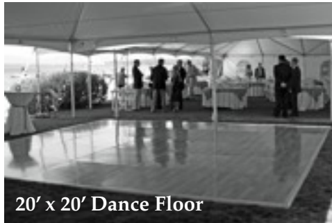
20' x 20' Dance Floor