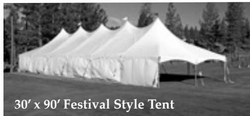
30' x 90' Festival Style Tent