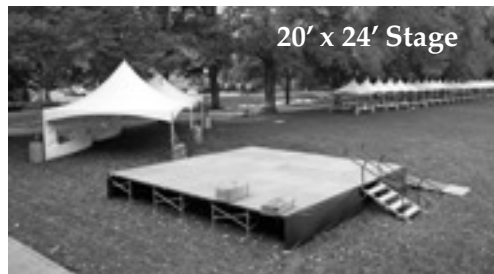
20' x 24' Stage

Access Ramp.....$4.00 linear ft. Extra Stair $25.00