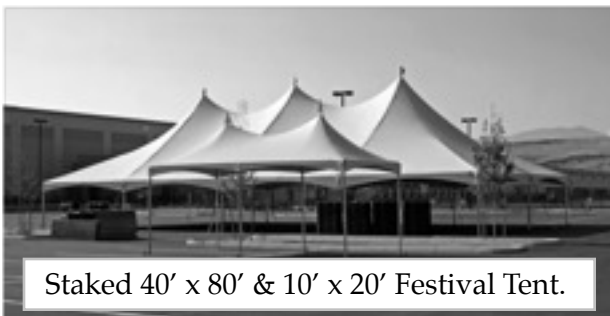
Staked 40' x 80' & 10' x 20' Festival Tent.