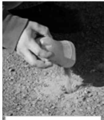
1- Sand fills the hole...

5 Nothing will spoil an event faster than an unsafe tent. Advanced, engineered tent systems only work as designed when proper anchoring methods are properly applied. Camelot Party Rentals is committed to creating the safest environment for your special event and leaving as minimal a trace as possible after the event.