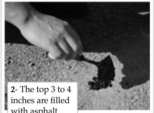
2- The top 3 to 4 inches are filled with asphalt...