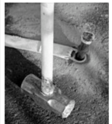
A fully driven stake. All that's left is to sweep up the dirt!

2 Once the guide hole is drilled the stake can be driven into the ground. We drive the stakes into the ground at a near vertical angle which provides both the maximum holding power in asphalt and the cleanest method of extraction. Only 3 to 4 inches of the stake will remain above the ground allowing for the lowest (and again, safest) point when securing the guy line.