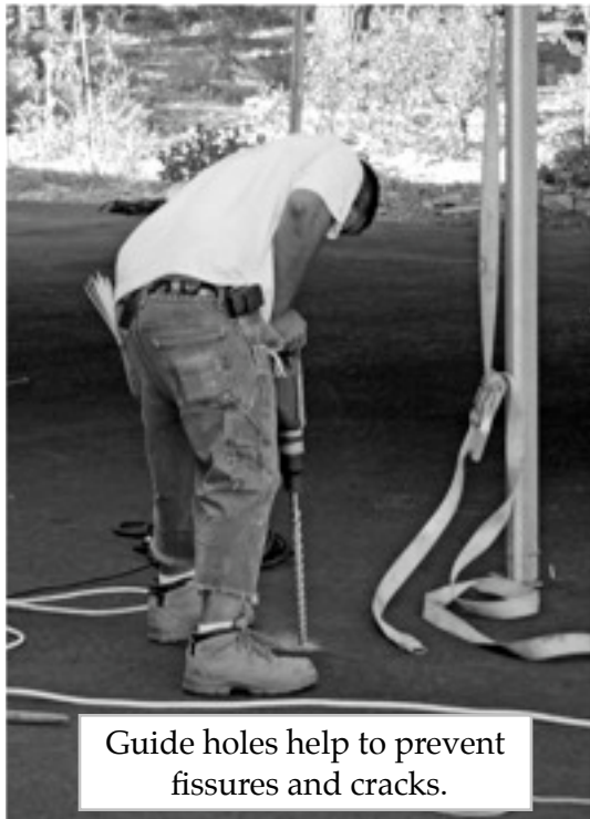
Guide holes help to prevent fissures and cracks.

● When installing a tent nothing is more important than the safety of your guests. The safest method of securing a tent is by driving stakes into the ground. When installing a tent on asphalt we often encounter concerns that if stakes are pounded into the surface it will be irreparably harmed. We hope this sheet will dispel some of the concern's about inserting and extracting stakes in asphalt.