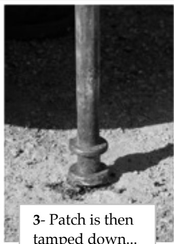
3- Patch is then tamped down...