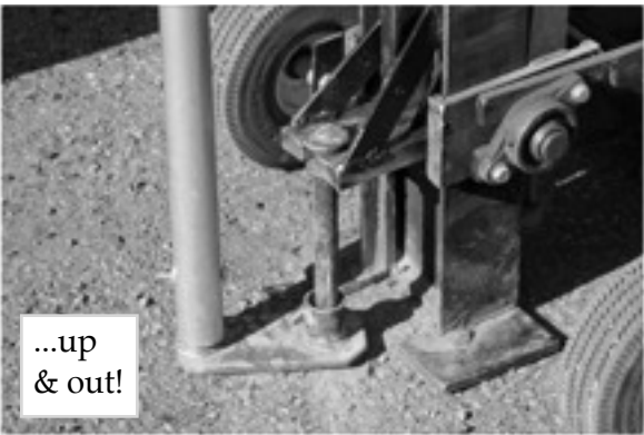
...up & out!

3 Once the event is over and the tent is ready to be taken down, the stakes are pried out with a specially designed lever that fits our stake heads and shafts. The method in which the stakes are installed allows for a cleaner extraction which leads to a better and more complete repair.